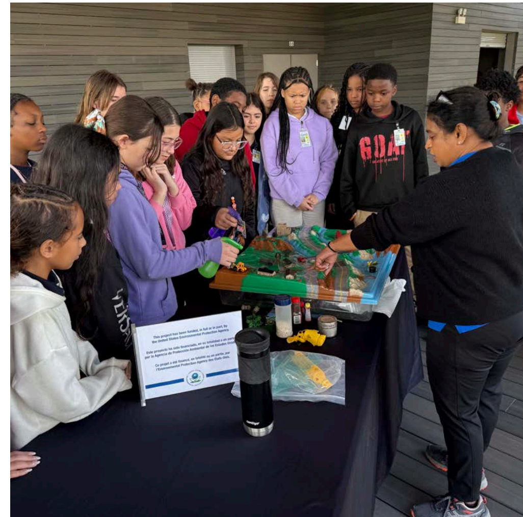
Water Quality Lessons at the Terrebonne Aquatic Clinic