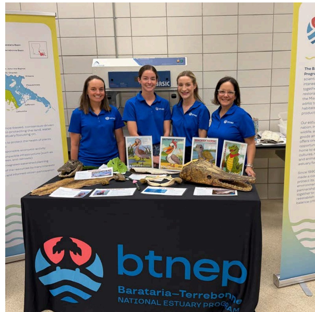
LUMCON Open House