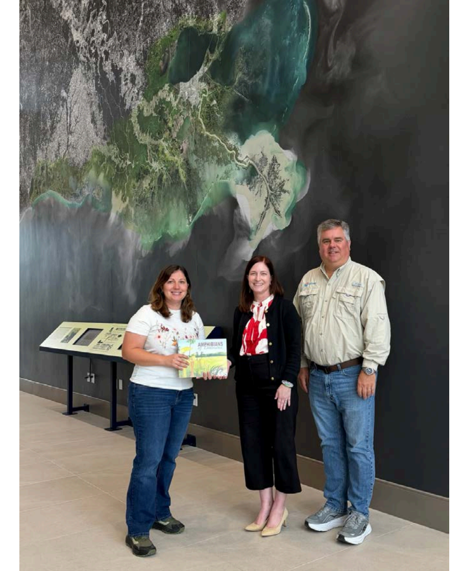
State Library Program