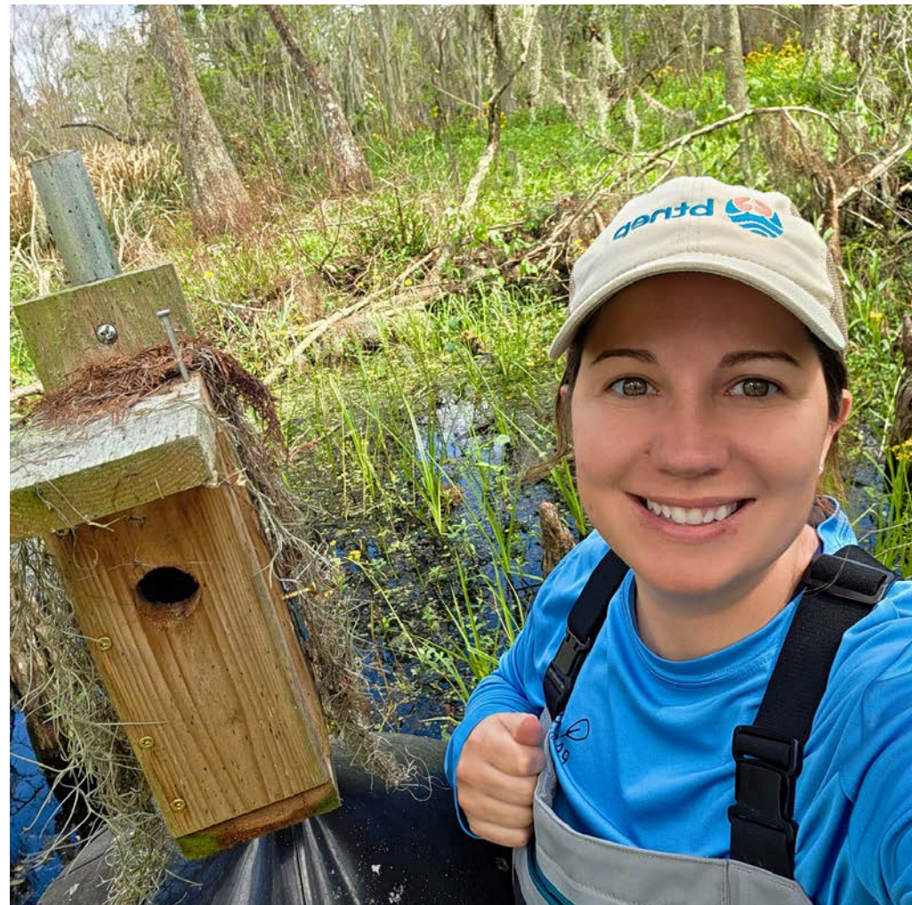
Warbler Nest Boxes