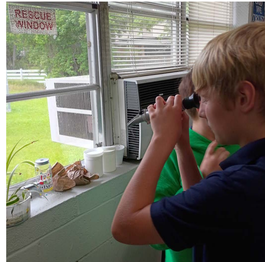
“Louisiana’s Saltwater Situation”