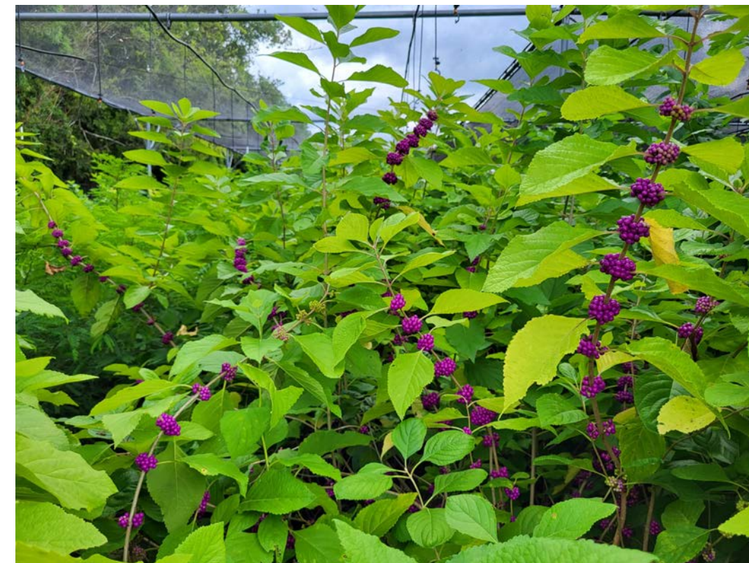
BTNEP Native Plant Nursery @ Nicholls Farm