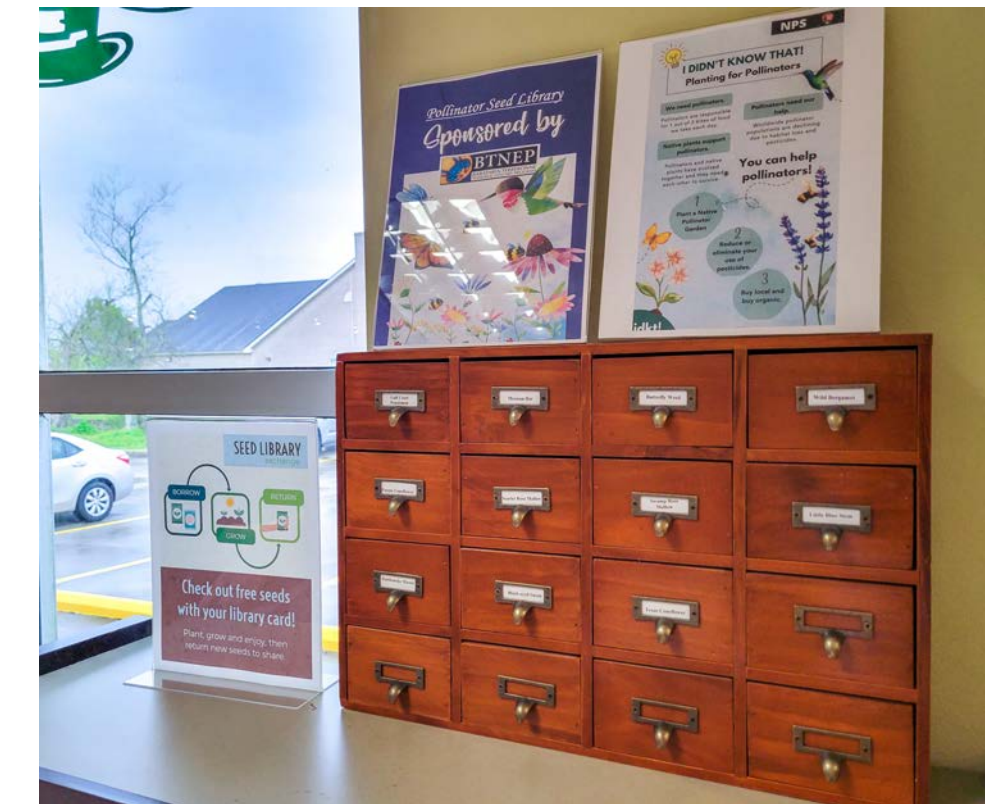
BTNEP Native Seed Library @ Thibodaux Branch