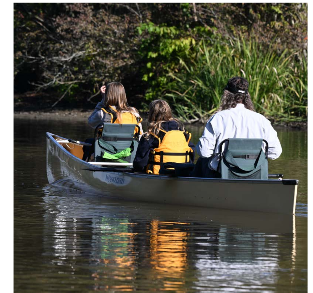
ATC Grant to Update the BTNEP "Paddle Guide"