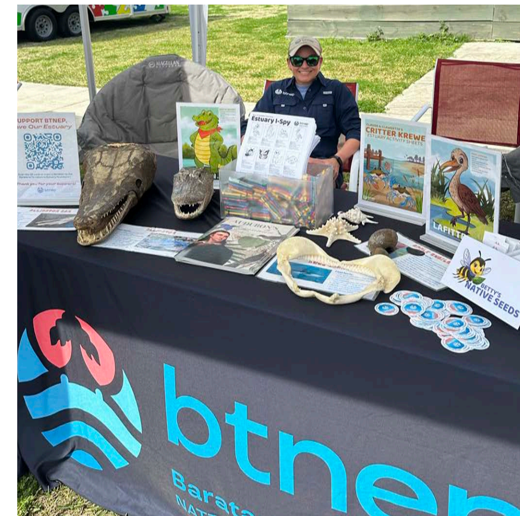
Cook-Off for the Coast