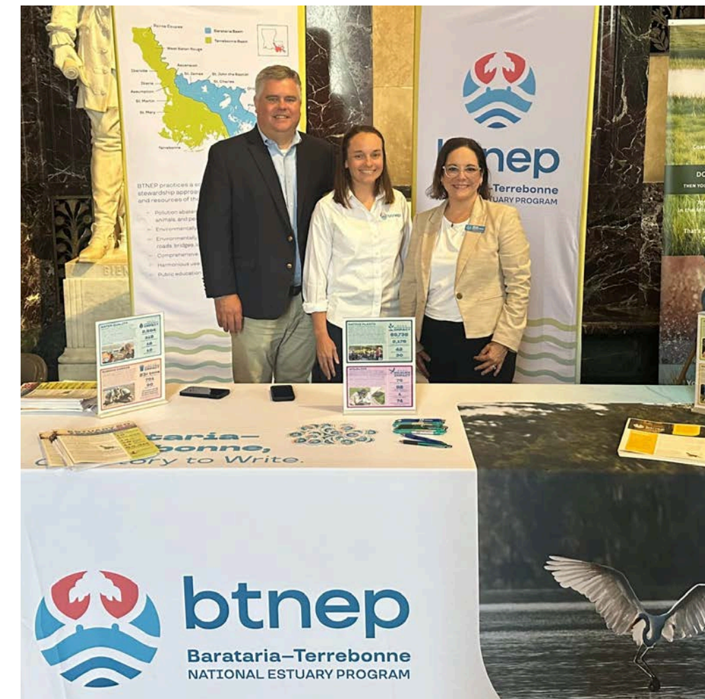
Coastal Day at the Capitol