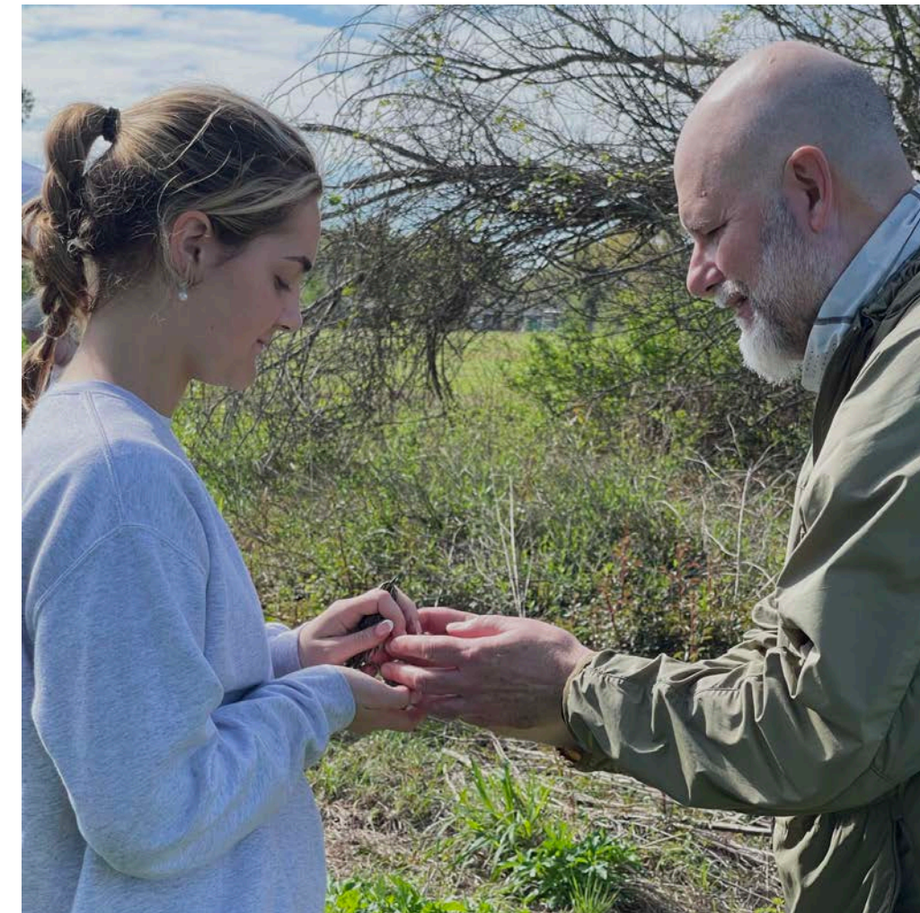
Sparrow Banding at the Farm