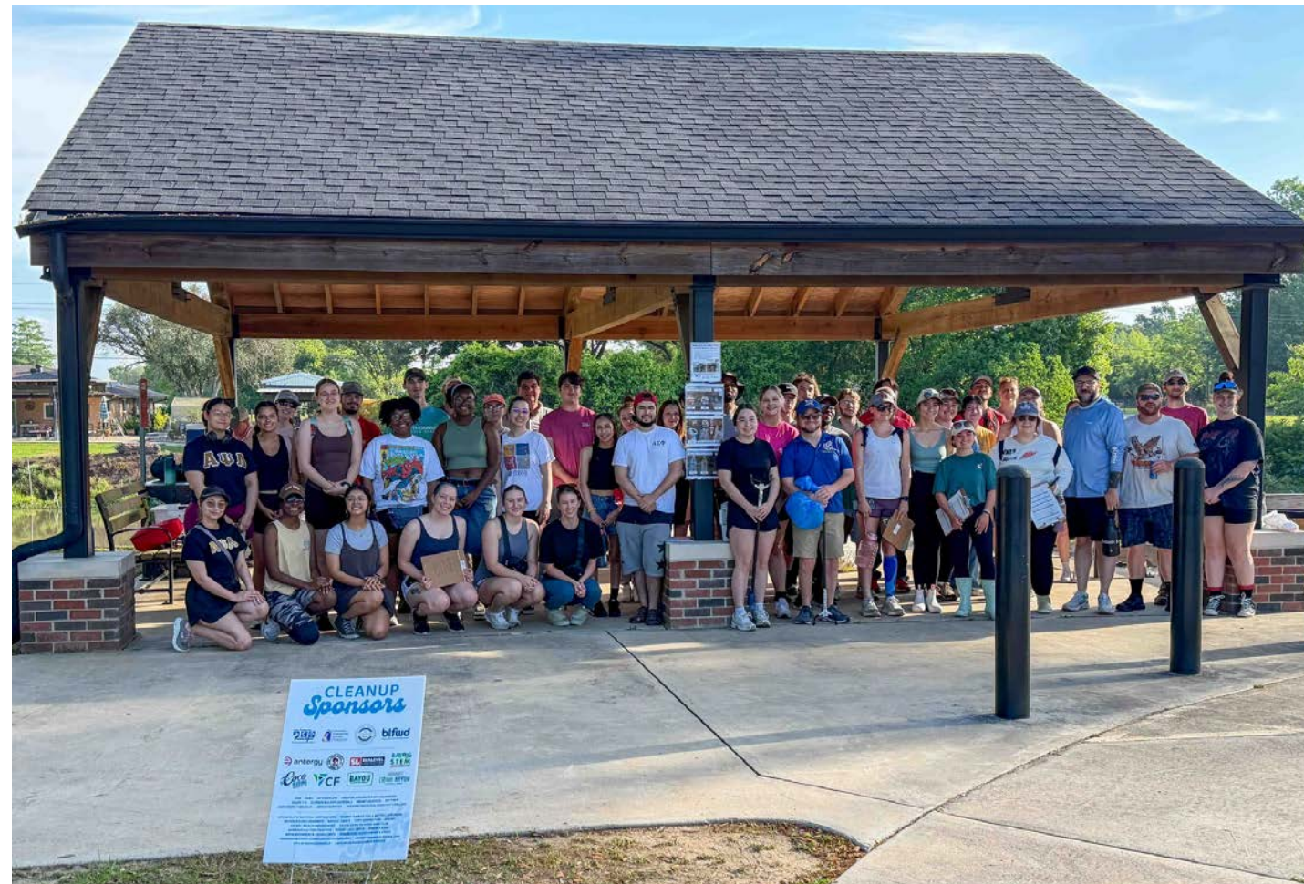
BTNEP's Bayou Clean Up