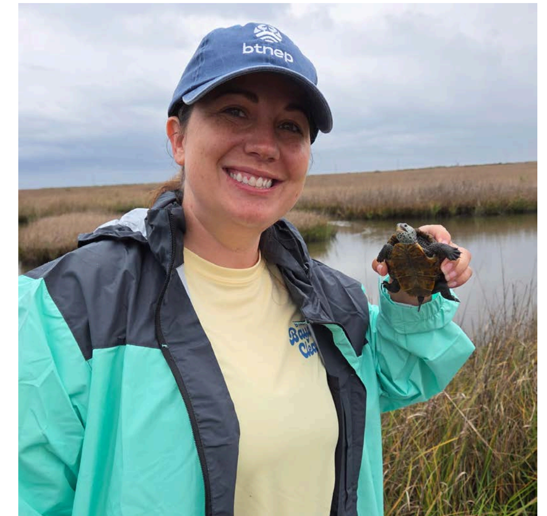
Diamondback Terrapin Release