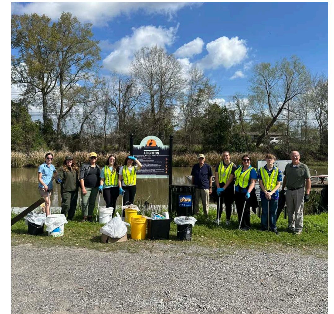
“Trash Talkin” Field Trip