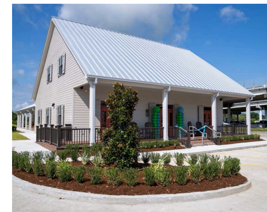
Louisiana's Cajun Bayou Visitor's Center