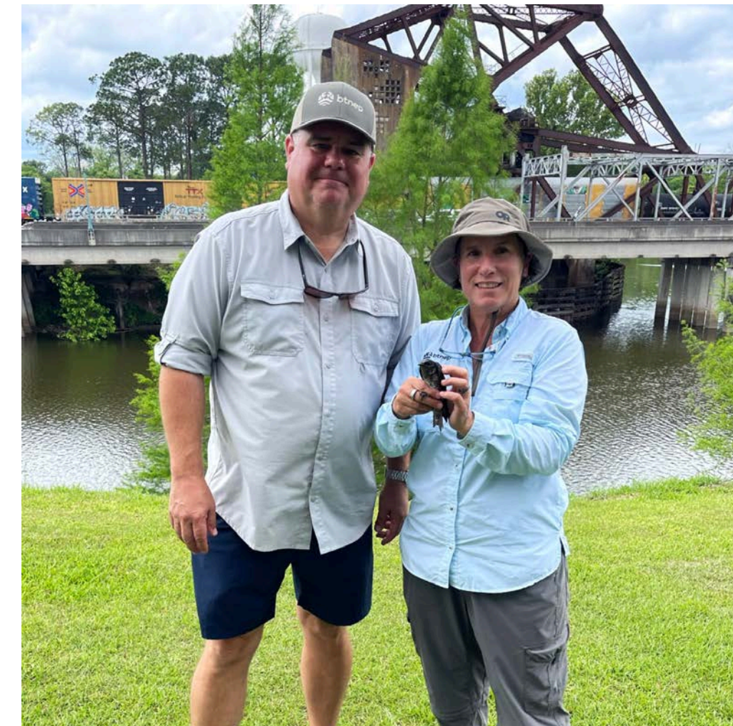
Purple Martin Conservation Initiative