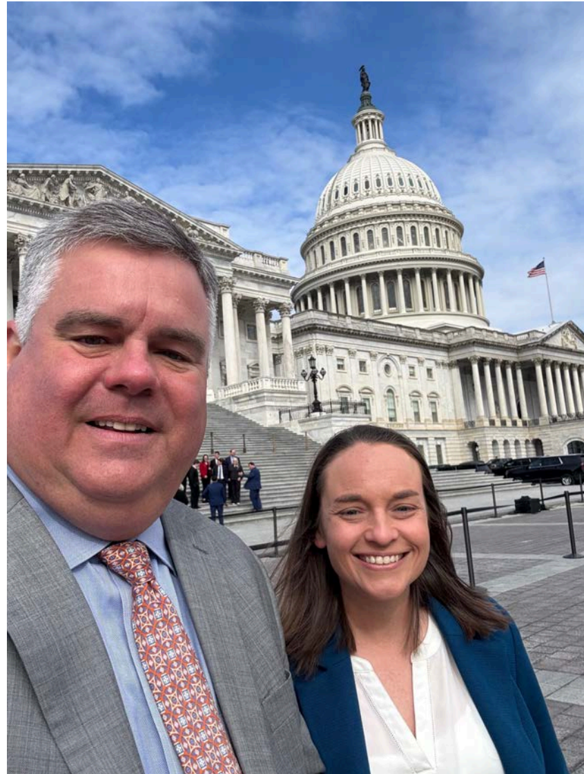
NEP Week in D.C.