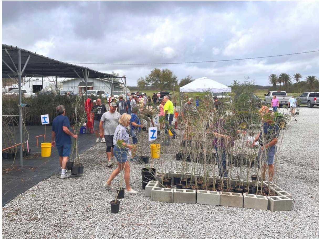
Native Tree Giveaway