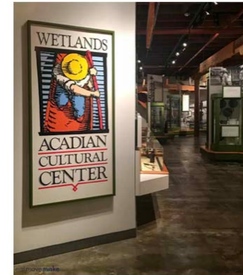
Wetlands Acadian Cultural Center