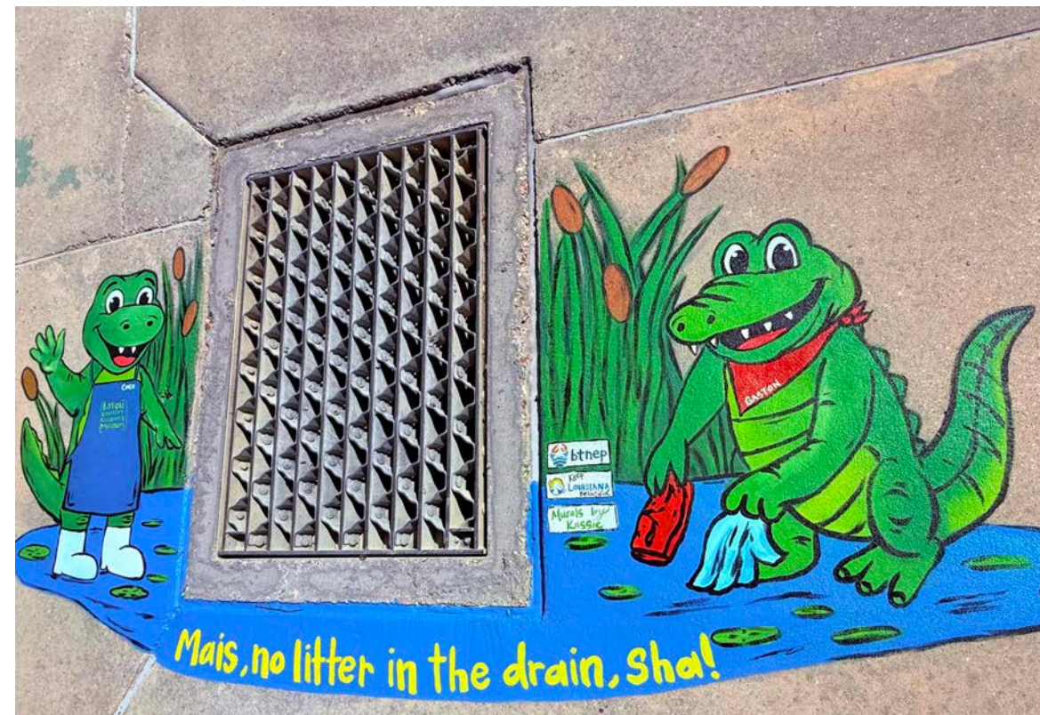
Bayou Country Children's Museum and BTNEP Storm Drain