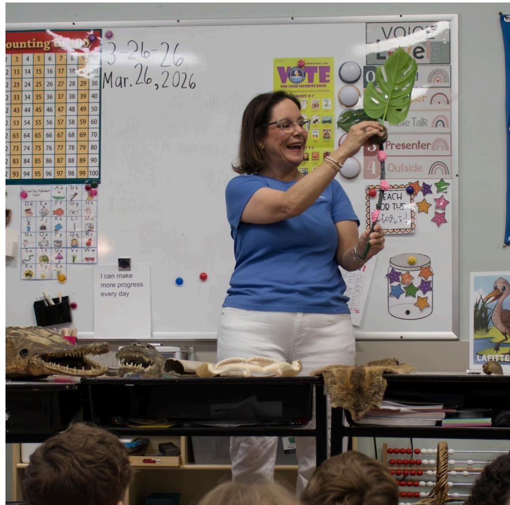
“Claude & Claudette’s Estuary Adventure”