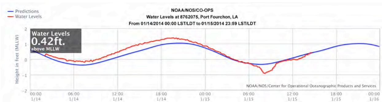
Figure 6. Predicted Tidal Range and Water Levels prior to and during the day of the survey.