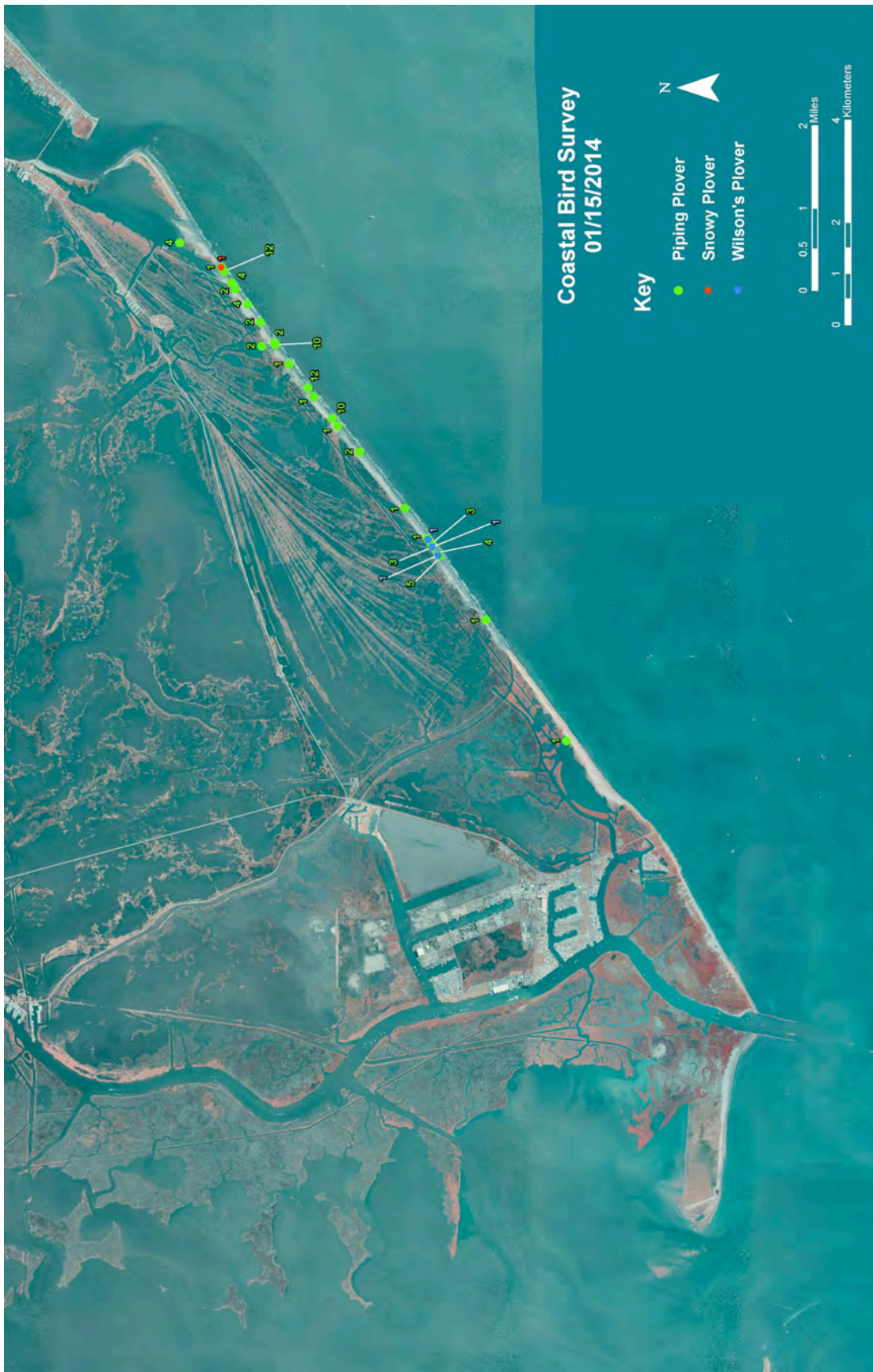
Figure 5. Locations and abundance of select shorebird species.