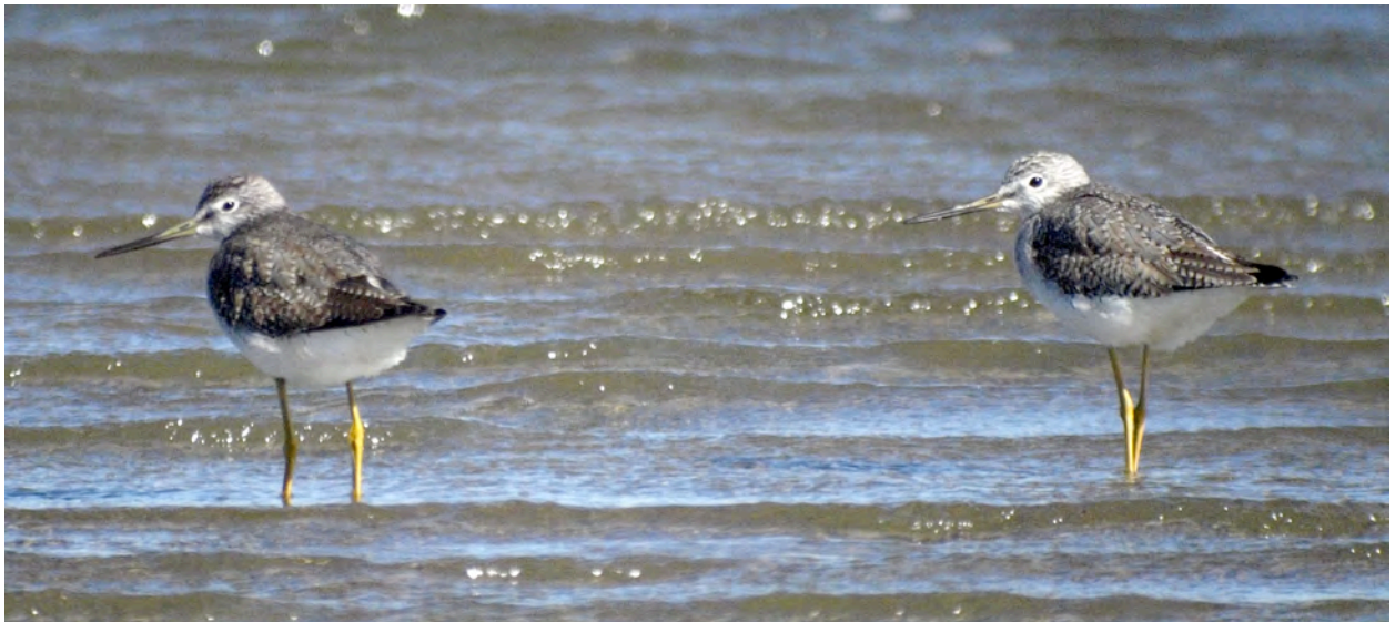
Figure 7: Greater Yellowlegs observed on January 15, 2014 survey.