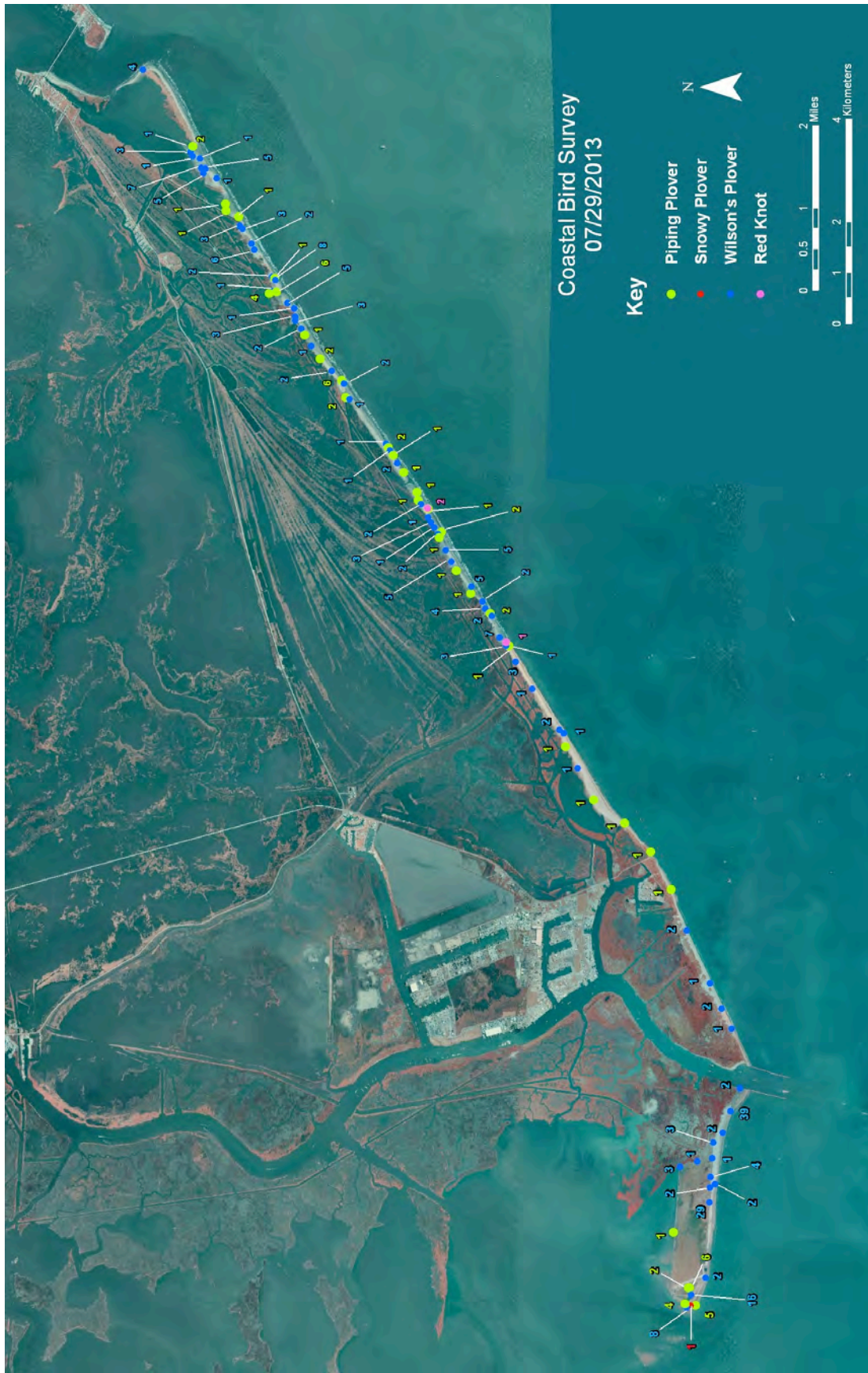
Figure 5. Locations and abundance of select shorebird species.