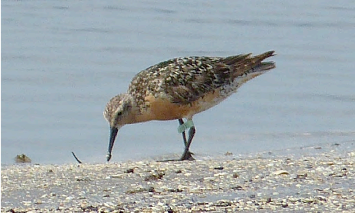
Figure 6: Banded Red Knot encountered during the July 29, 2013 survey.