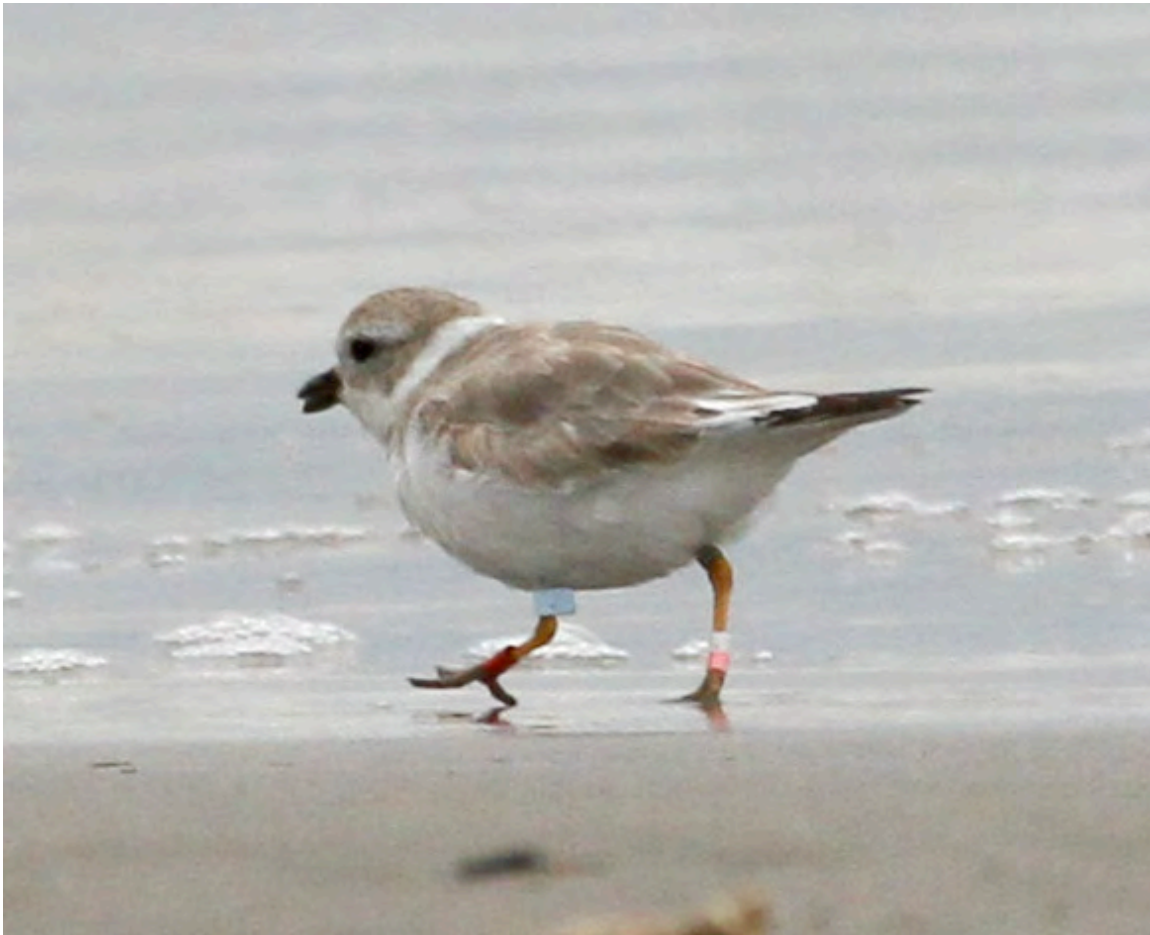
Figure 6: Piping Plover encountered on March 20, 2013 survey.