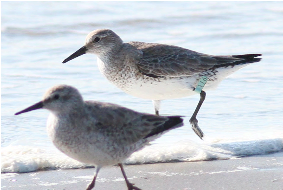
Figure 6: Red Knots encountered during the February 6, 2013 survey.