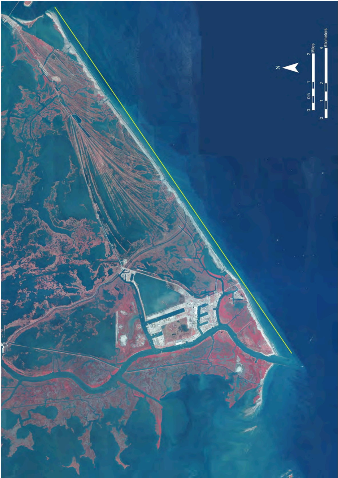
Figure 4. Green line represents the geographic extent of the survey.