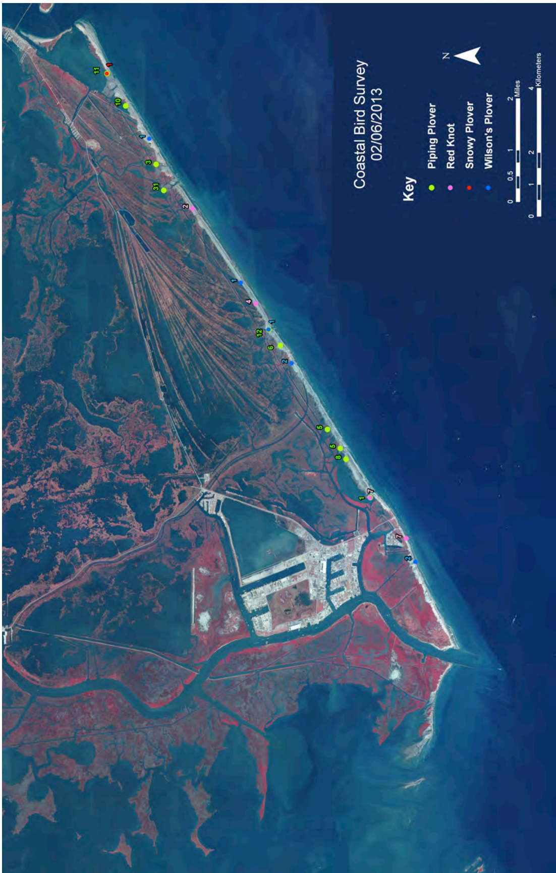
Figure 5. Locations and abundance of select shorebird species.