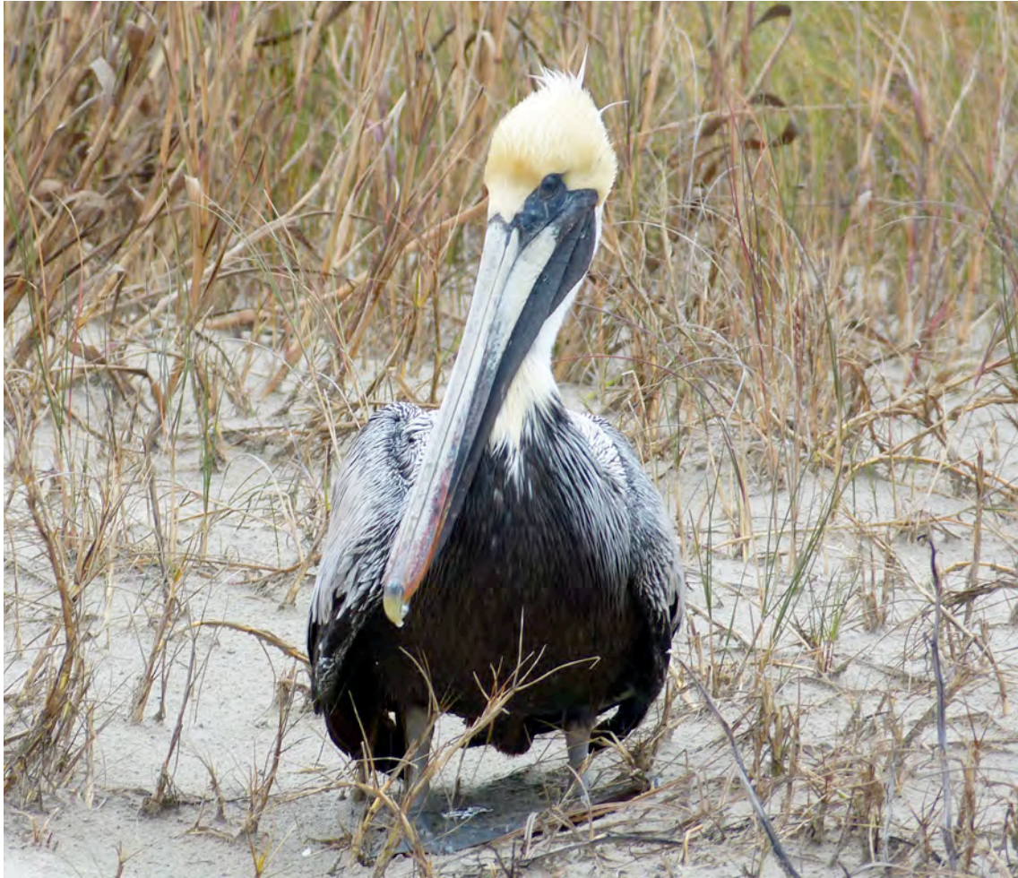
Figure 7: Brown Pelican observed on February 12, 2014 survey.