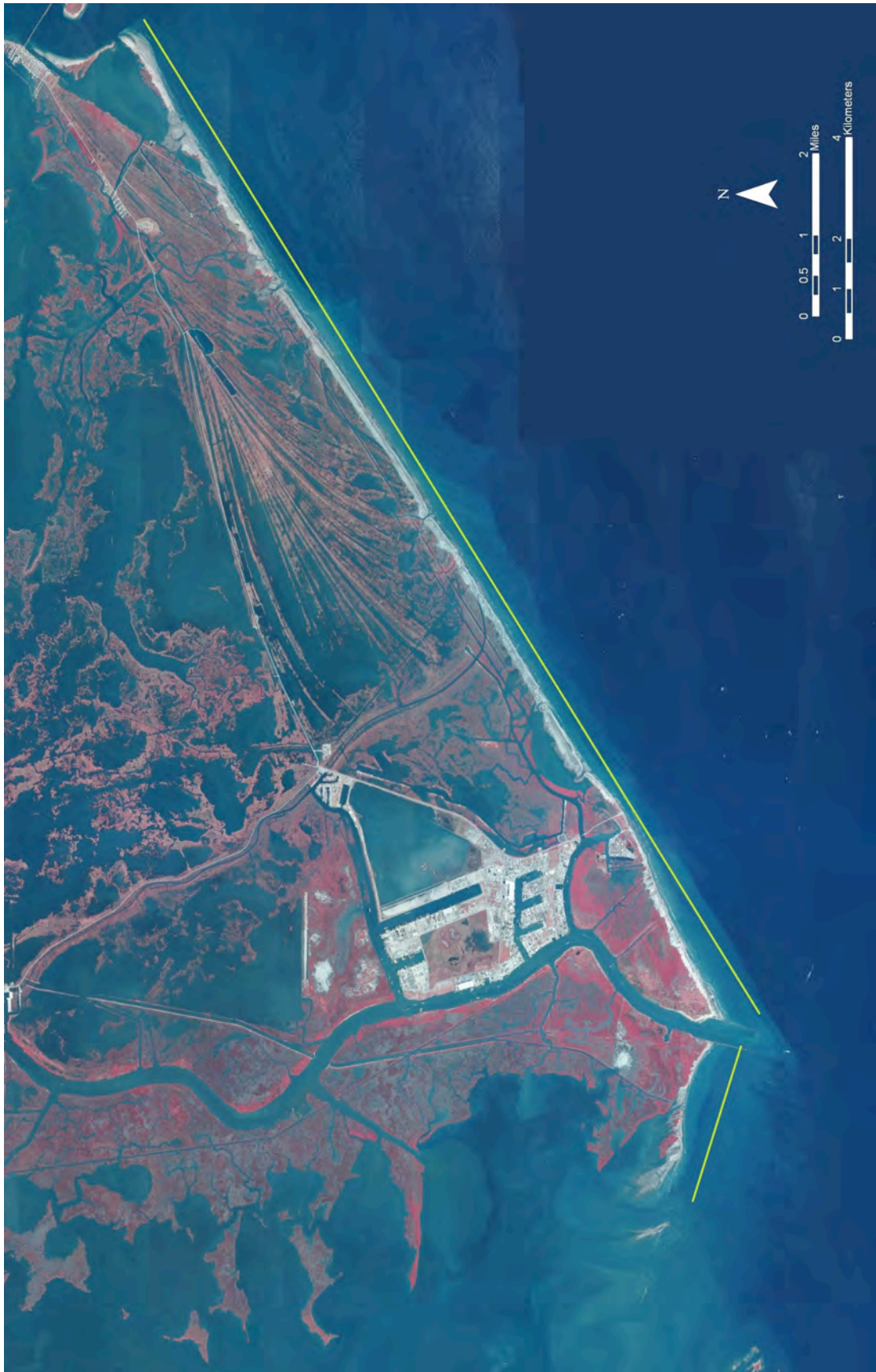
Figure 4. Green line represents the geographic extent of the survey.