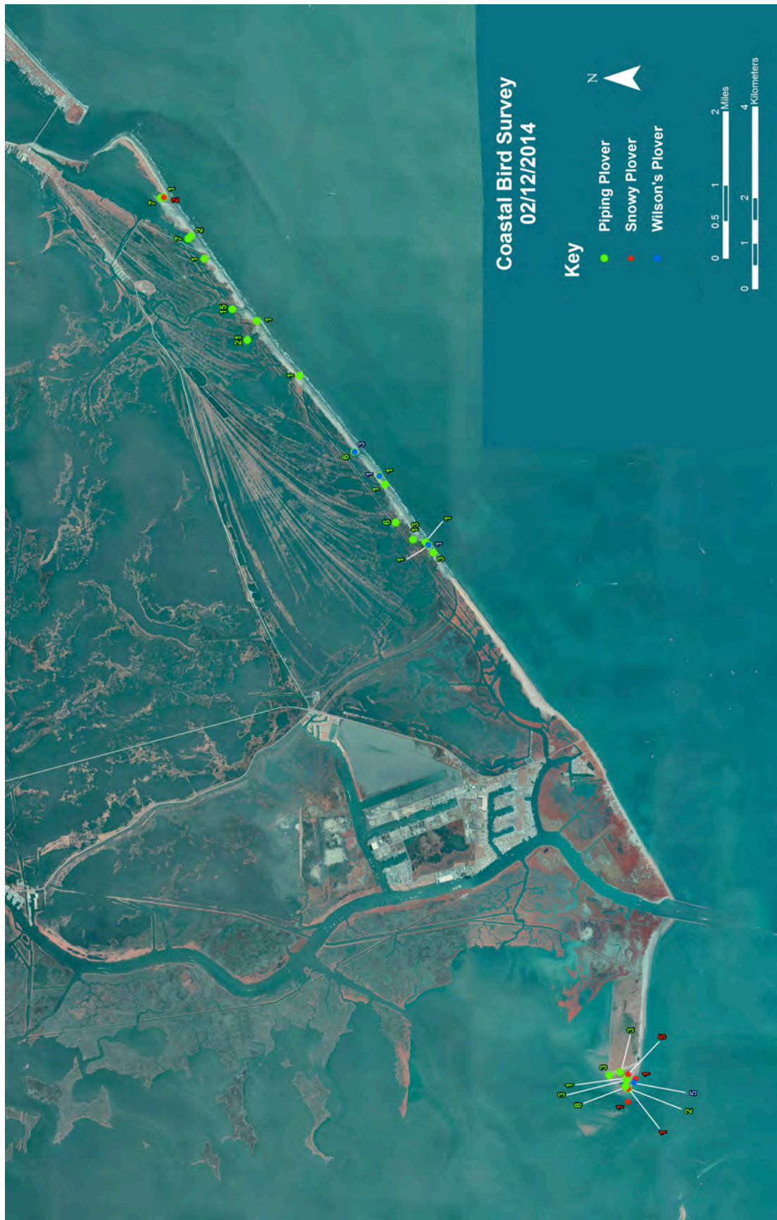
Figure 5. Locations and abundance of select shorebird species.