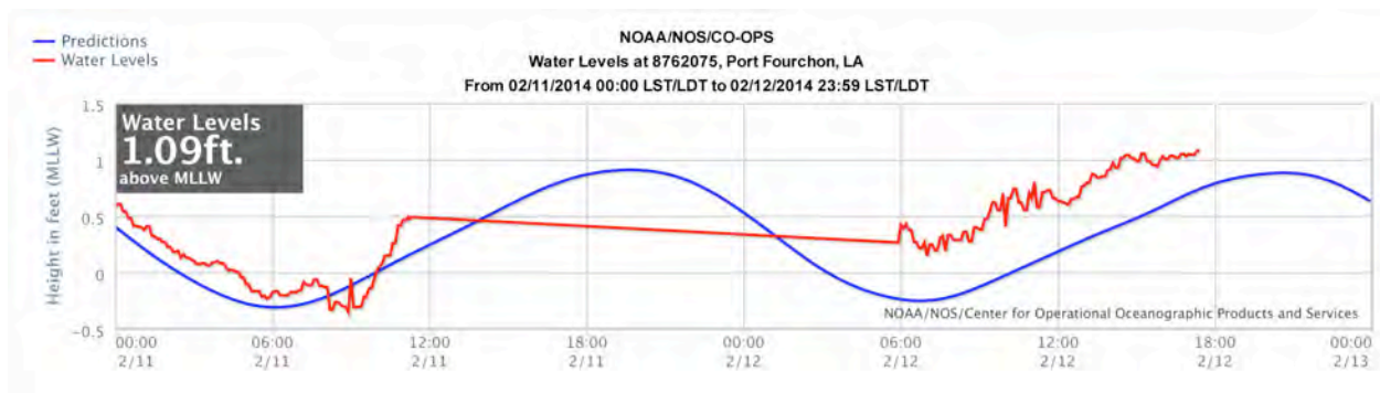
Figure 6. Predicted Tidal Range and Water Levels prior to and during the day of the survey.