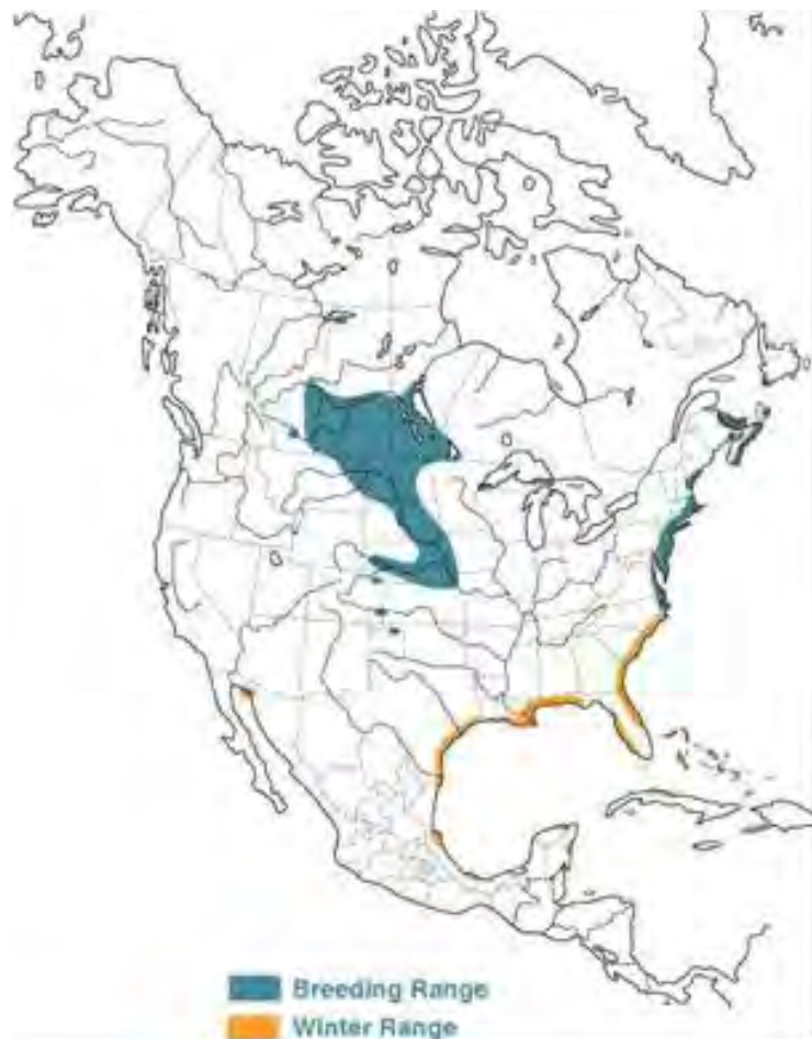
Figure 2. Piping Plover Breeding and Winter Range.

In addition, the Gulf of Mexico is a key wintering area for Piping Plover with much of it designated as critical habitat under the Endangered Species Act (ESA). Data from the International Piping Plover Survey, conducted every five years since 1991, indicate that 73-93% of all wintering plovers counted have been on the shores of the Gulf of Mexico. Therefore protection and restoration of these critical habitats are warranted. Figure 2 defines both the breeding range and wintering range for this species. Figure 3 defines critical habitat for Piping Plover in the Port Fourchon area of Louisiana.