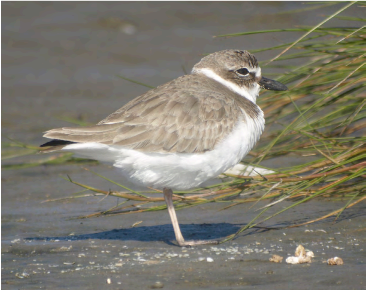
Figure 7: Wilson's Plover observed on November 20, 2013 survey.