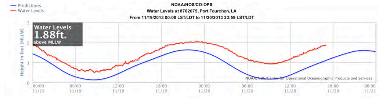
Figure 6. Predicted Tidal Range and Water Levels prior to and during the day of the survey.