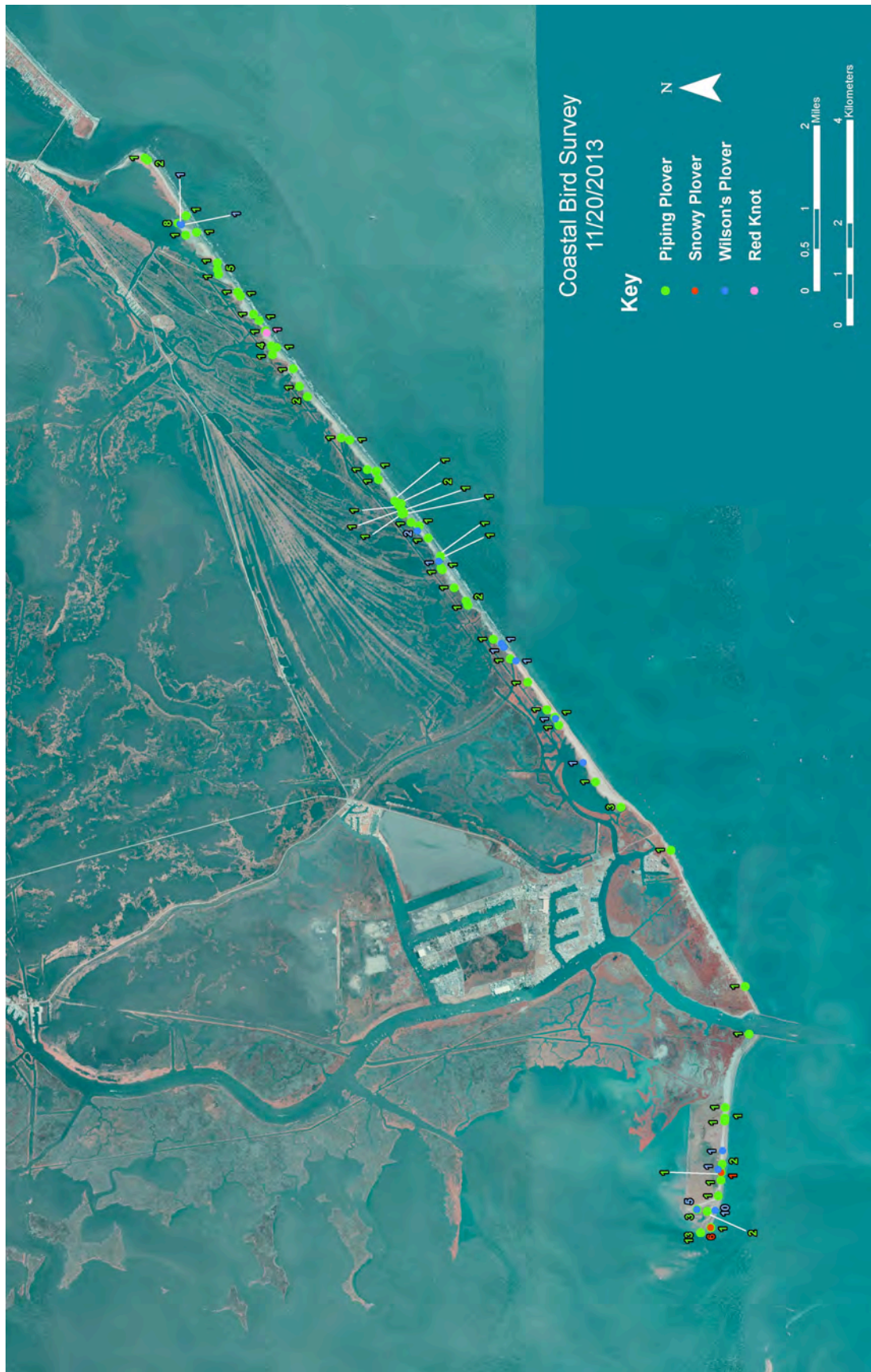
Figure 5. Locations and abundance of select shorebird species.