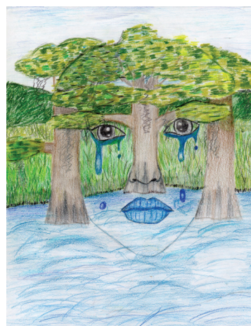
Artwork by Nikita A. 12th grade

The Barataria-Terrebonne National Estuary Program (BTNEP) wants the youth of the area to value these unique wetlands. Using original art created by local K-12 students, BTNEP captures the beauty of forests, swamps, marshes, islands, bayous, local wildlife, and culture in an annual calendar for residents. Created with attention to details, this educational tool provides an important venue for students and the public to value the aesthetics of the estuary.