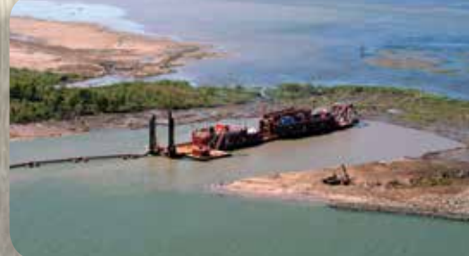
Dredging the West Bay diversion channel

Project Partners: CWPPRA, USACE, CPRA, Plaquemines Parish Government