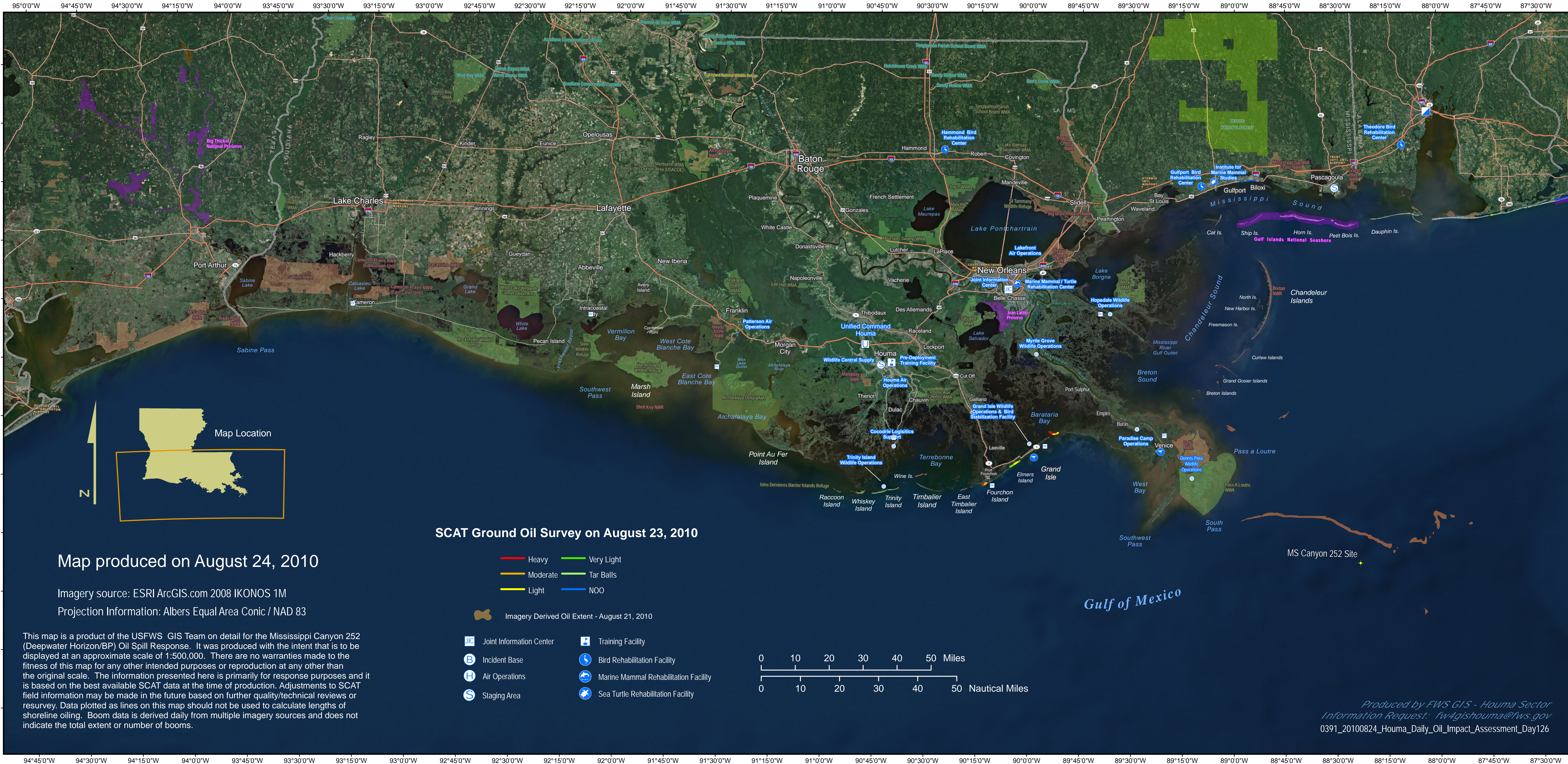
SCAT Ground Oil Survey on August 23, 2010